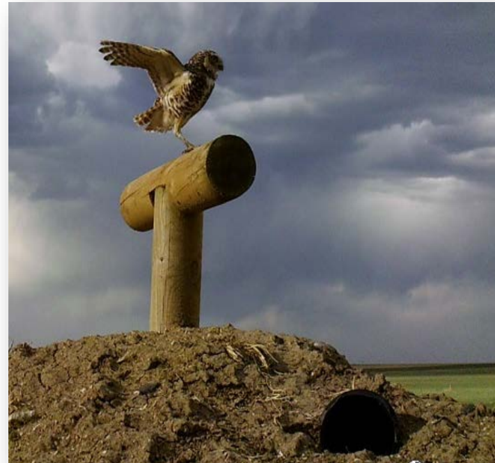
Burrowing Owl ( Athene cunicularia )